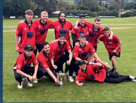
3rd Team - 2023 Birchall Cup Winners

The league comprises of 28 clubs based from Earby and Barnoldswick in the North down to Walkden in the South. ( www.nwcl.co.uk )